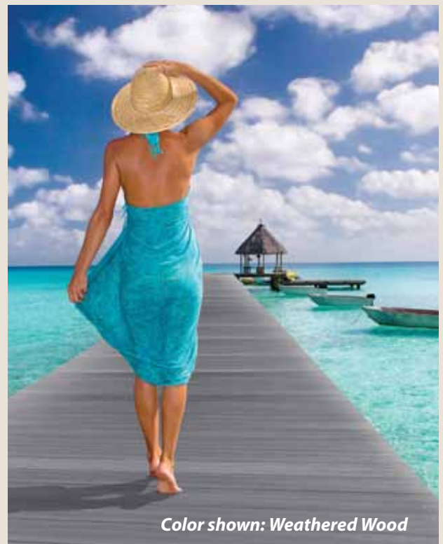
Color shown: Weathered Wood

*Colors may vary due to printing, please see actual product before you select a color.