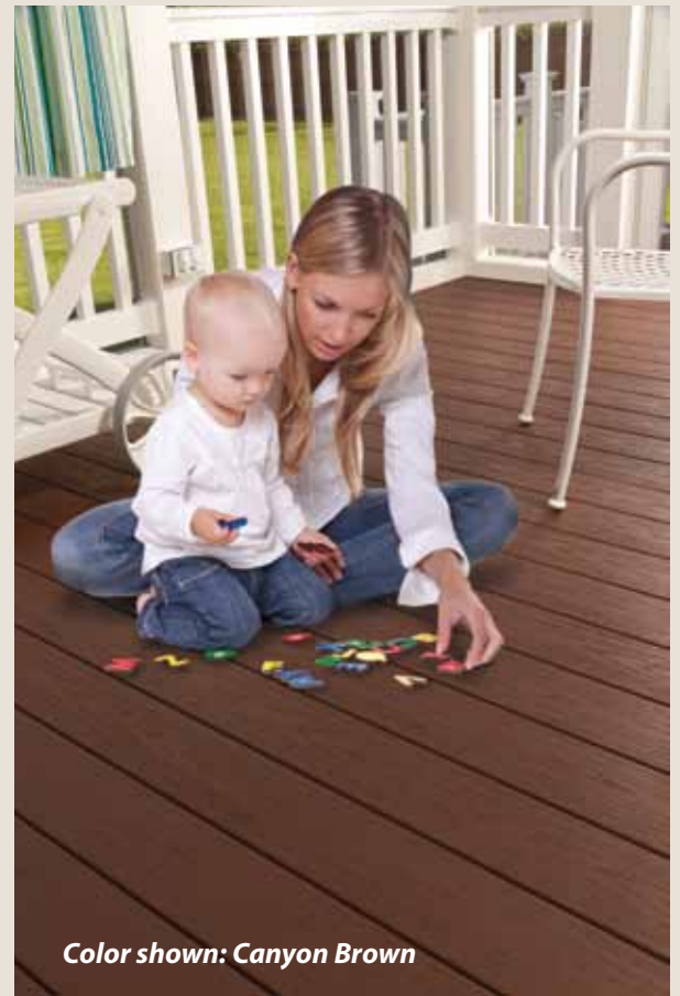
Color shown: Canyon Brown

*Colors may vary due to printing, please see actual product before you select a color.