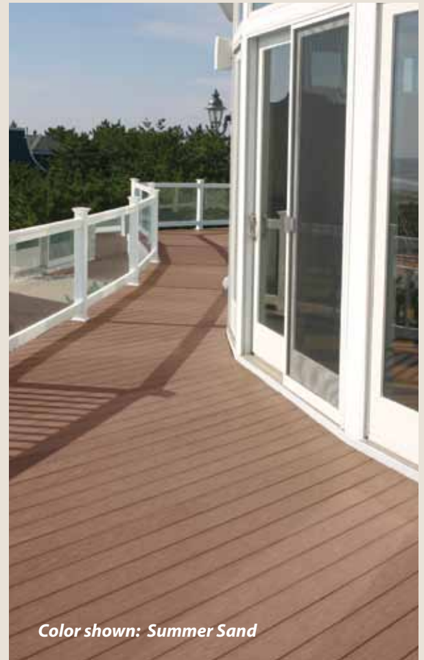
Color shown: Summer Sand

*Colors may vary due to printing, please see actual product before you select a color.